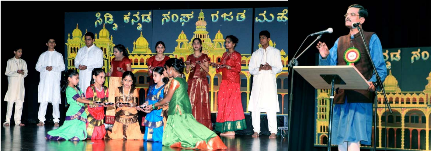
Hechevu Kannadada Deepa Dance