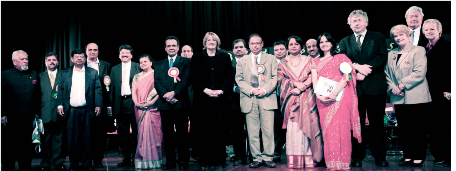
Dignitaries and Sydney Kannada Sangha Executive Committee