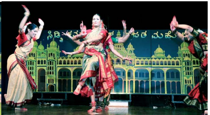
Jai Baratha Jananeya Thanujathe Dance