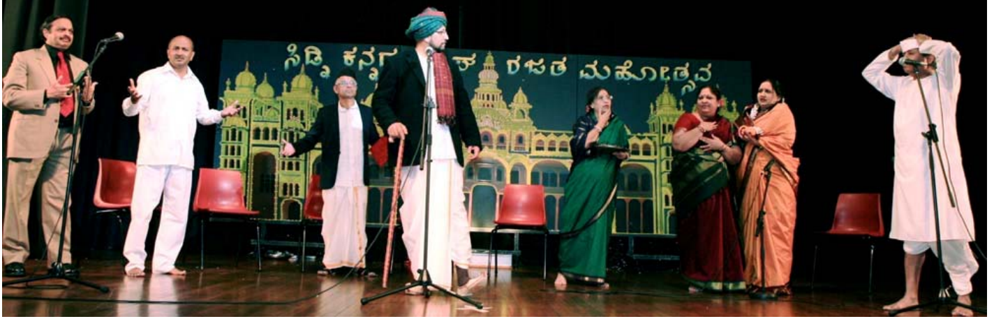
Drama – Maduve, Maduve, Maduve.....”